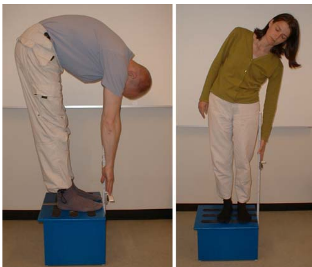
Fig. 1 Measuring the fingertip-to-floor distance in flexion and lateral bending

unit with ultrasound transmitters and receivers. The transmitters are taped to the skin and send sound pulses at 20 Hz. Three receivers, placed about 1 m behind the participant, pick up the pulses and transmit the information to a computer. There, the three-dimensional movement of each transmitter is calculated and plotted. Eight transmitters were placed on the subjects' back (see Fig. 2).