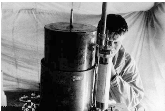
Fig. 1 Paolo Cerretelli portrayed behind a Tissot spirometer inside a tent at the base camp of Mount Kanjut-Sar, 1959

the reduction in ventilation induced by oxygen breathing was greater in chronic hypoxia than in normoxia. The same technique was resumed 25 years later for investigating the chemoreflexogenic drive of climbers who reached the highest peaks on Earth without supplementary oxygen (Oelz et al. 1986). The second experiment (Cerretelli 1961) reported data of lung volumes in subjects acclimatised to altitude. The third, and perhaps most significant experiment in the present context (Cerretelli and Margaria 1961), demonstrated that the decrease in maximal oxygen consumption ( \dot{V}O_{2max} ) in chronic hypoxia was equivalent to that in acute hypoxia. This implied that the increase in haematocrit or haemoglobin concentration resulting from acclimatisation was unable to increase \dot{V}O_{2max} .