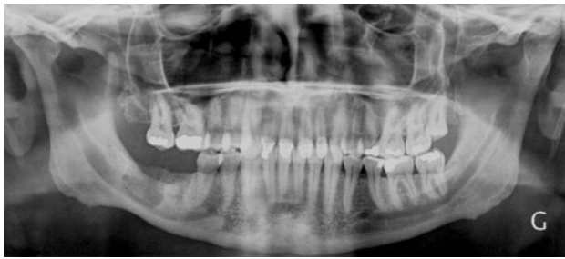
Fig. 3 Panoramic X-ray showing no change in the appearance of the right IAN canal