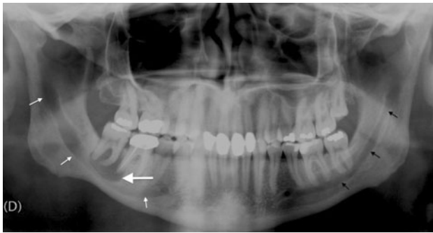
Fig. 1 Panoramic X-ray showing a radiolucent lesion ( large arrow ) involving both roots of tooth 47 and the distal root of tooth 46, suggesting a radicular cyst. The entire osseous canal of the right IAN is widened ( thin white arrows ). For comparison, note the normal left IAN canal ( thin black arrows )

a maximum vertical width of 9 mm, whereas the corresponding width of the canal on the contralateral side was only 4 mm. Measurements were performed on sagittal oblique CT reformations and sagittal oblique T1-weighted MR images through the inferior alveolar canal. They were obtained and recorded at multiple levels bilaterally using OsiriX version 4.0 software (64-bit extension; Pixmeo, Geneva, Switzerland). The maximum width was extracted from all available data (20 measurements on each side). On inversion recovery (IR) sequences, the enlarged right IAN signal was slightly hyperintense. After injection of gadolinium, a central non-enhanced nerve surrounded by an enhanced perineural vascular plexus was seen on the right side (Fig. 2a–c). This enhancement pattern was similar to that of the contralateral IAN. The slightly increased signal on the IR sequence in the presence of the absolutely normal nerve enhancement pattern was interpreted to suggest minor edema of the enlarged nerve.