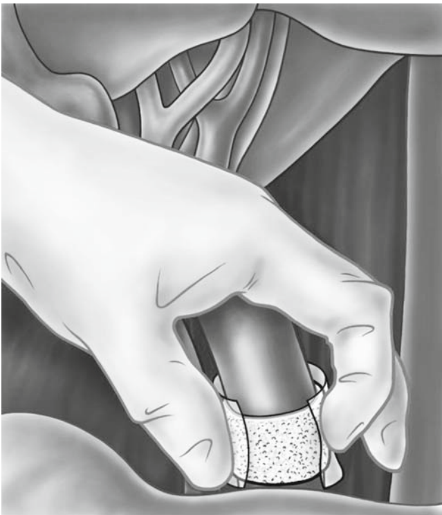
Fig. 2. Control of the bleeding by a TachoSil patch around the portal vein