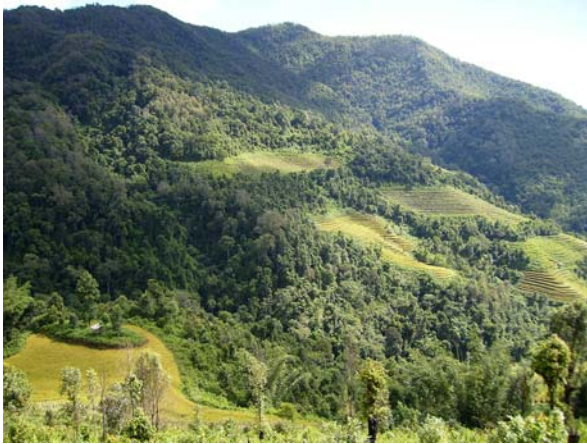
Fig. 3 Much of the gibbons' natural habitat has been converted to farmland.

inantly the subtropical forests in the rugged mountainous terrain around Mt Wokan (2605 m), the highest peak in the area (Haimoff et al. 1987; Lan and Guo 1995). X-L. Jiang ( pers. obs. ) still heard calls of these gibbons in 1992. Detailed information on population size of the species at Nangunhe is not available.