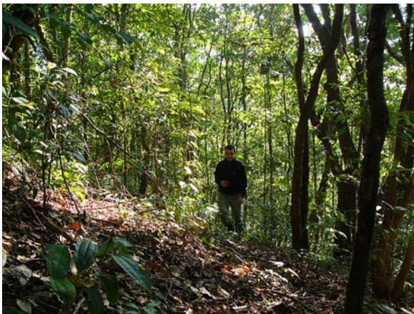
Fig. 2 Extensive tracts of secondary forest characterize the upland areas at Nangunhe Nature Reserve.