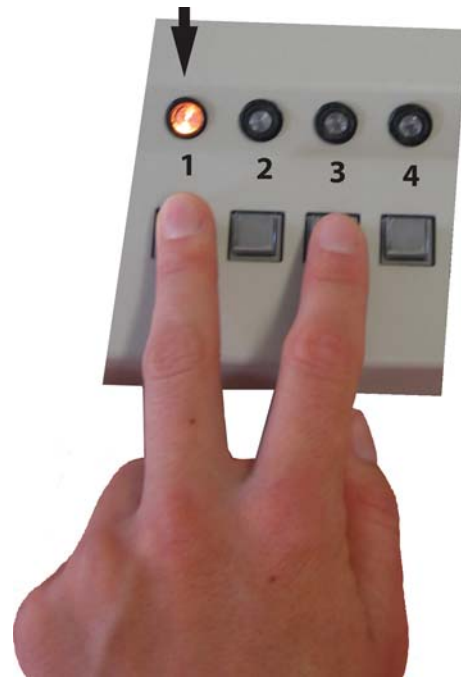
Fig. 1 Experimental setting for the left hand. Subjects had to press as fast as possible the corresponding key (1–4) in response to the turning on of the lights (downward arrow), using their index finger for keys 3 and 4 and their middle finger for keys 1 and 2 (vice versa for right hand: index finger for keys 1 and 2, middle finger for keys 3 and 4)

In the sequence learning condition, the task consisted of eight blocks of 100 stimuli each. In blocks 1–3 (R1–R3) the