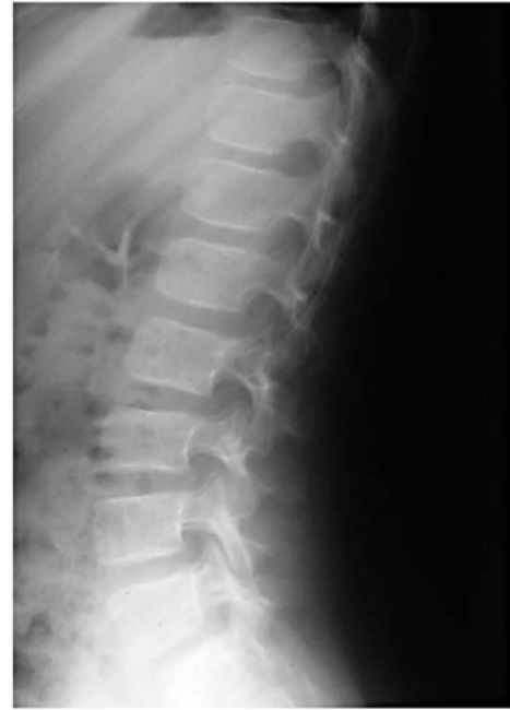
Fig. 6 Final thoracolumbar spine radiograph reveals no residual deformity in standing position

The mechanism of the injury was thought to be pure flexion. In 1965, Howland et al. associated this particular fracture with lap belt use during a motor vehicle accident [16]. Later, Smith and Kaufer hypothesized that Chance fractures associated with seatbelt injuries were due to distract-