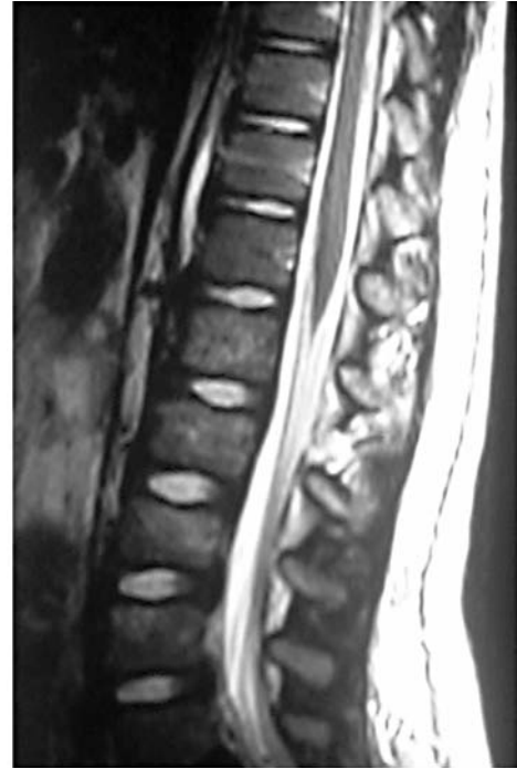
Fig. 2 Magnetic resonance imaging (MRI): on T2-weighted fat-saturated sequences, there is a hyperintensity signal alteration of the posterior ligamentous elements, evocative of a lesion of these structures