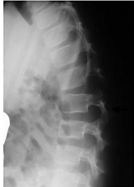
Fig. 3 Dynamic X-rays performed in flexion confirmed instability at two levels (L1-L2 and L2-L3) by the increased height of the intervertebral foramina and by a widening of the posterior part of the intervertebral space