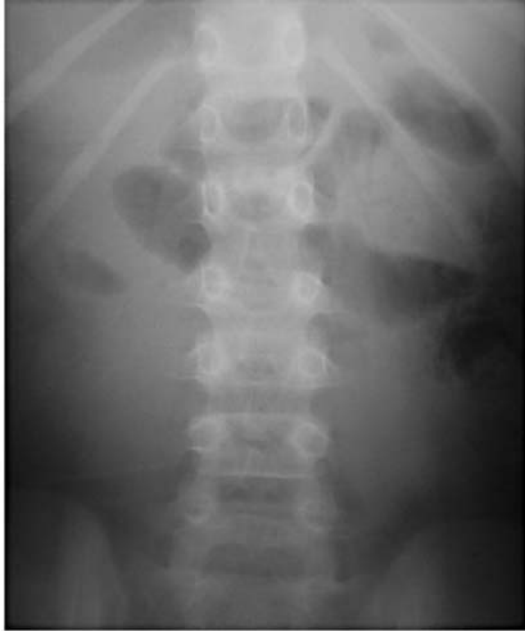
Fig. 1 Widening of the interspinous space between the first and the second and between the second and the third lumbar vertebrae was noted on the thoracolumbar spine radiographs. No fracture was suspected on these films