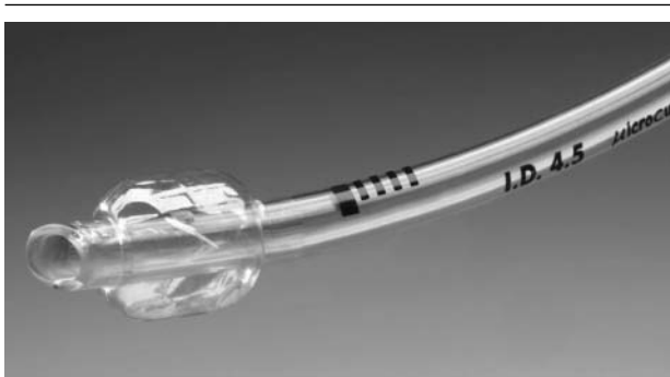
FIGURE 1 Microcuff® pediatric tracheal tube with high volume - low pressure cuff, semi-circular intubation depth-mark, cuff-free laryngeal tube shaft. Four points proximal to the semi-circular marking indicate the distance to it (in total 8 mm) which may be helpful when withdrawing a tube inserted too deeply, and when ary-epiglottic folds obstruct the view to the vocal cords in neonates and infants.

allowed insertion of an MPTT with an air leak at \leq 20 cm H 2 O inspiratory pressure and to seal the airway with a cuff pressure \leq 20 cm H 2 O [median 10 cm H 2 O (range 4–20)]. In two patients there was no air leakage at \leq 20 cm H 2 O inspiratory pressure and the tubes had to be exchanged with a smaller one. No endobronchial intubation or accidental extubation during the cardiac procedures occurred, and no problem related to inadequate exhalation or barotrauma due to the lack of a Murphy eye was observed.