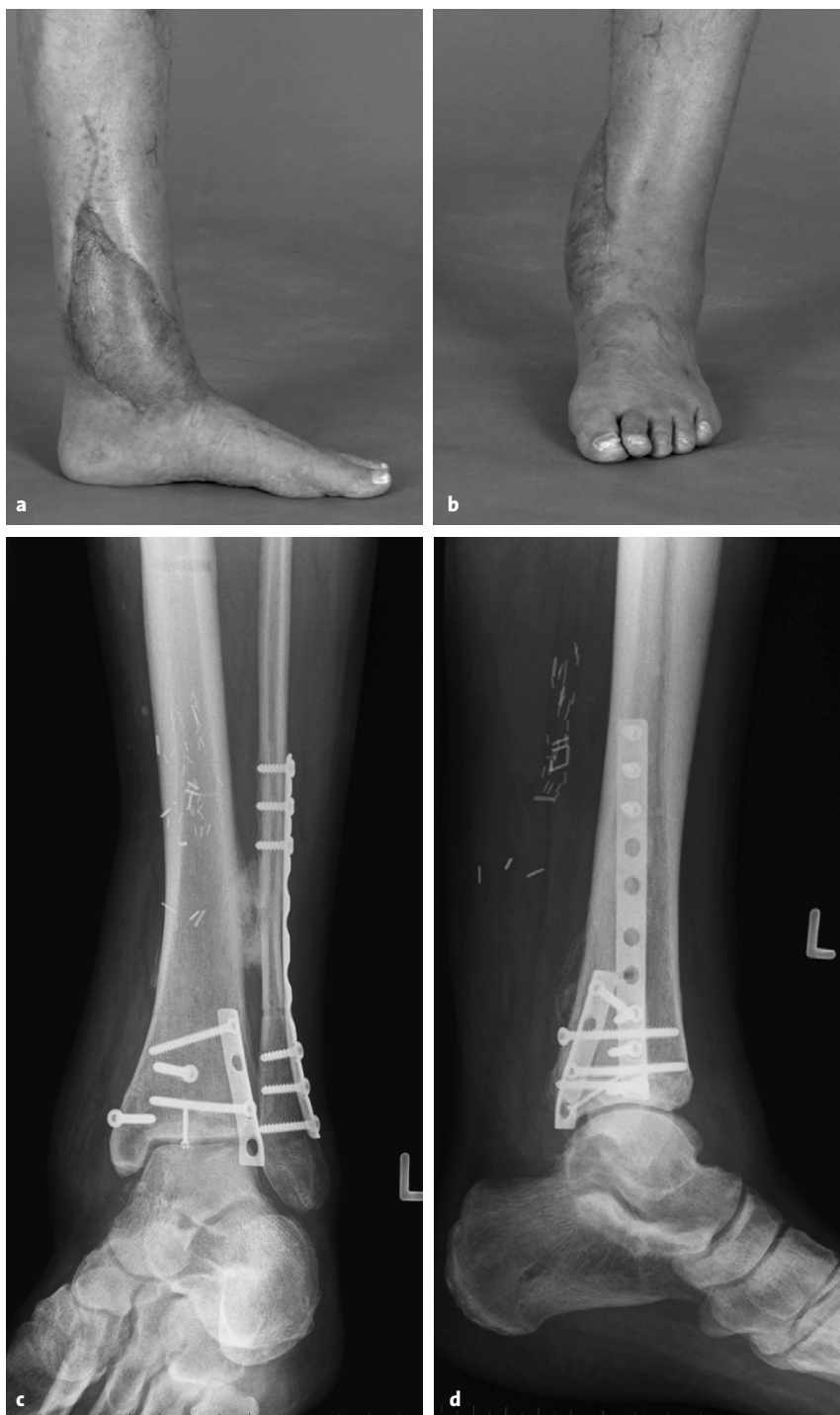
Figures 2a to 2d. a, b) Clinical result of the type IIIB fracture of Figure 1 after soft-tissue reconstruction with a microvascular flap. c, d) X-rays of the IIIB fracture 8 months after trauma with documented bone healing.

successful V.A.C. ® application [32]. Although the number of our patients is small for firm conclusions to be reached, a drawback of all studies reporting