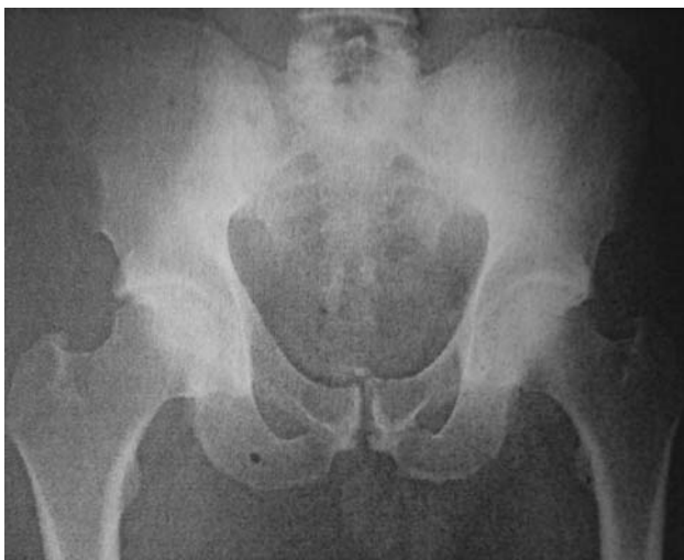
Fig. 3 Normal right hip X-ray 4 years after abscess drainage and traction

Nevertheless, the diagnosis of hip or groin pain remains challenging and the idea of an atypical adjacent infection should be kept in mind, especially in the presence of a chronic mono-articular joint affection. Because the clinical signs and symptoms of Brucella overlap with a variety of infectious and non-infectious diseases, the diagnosis can be perplexing. Localised abscess formation induced by Brucella is rare [8] but still an expected pathology, especially when an isolation of Brucella strain is possible from the culture. The majority of cases presenting as hip or groin pain associated with fever were attributed to infectious hip arthritis. In our case, however, we think that the primary process was the abscess formation in the gluteus minimus muscle. The delayed diagnosis is on the origin of the accompanying infection of the adjacent acetabular roof and the continuous manifestation of the symptomatology. To our knowledge, this is the first case of abscess Brucella of the hip region where usually all the feverish symptomatology is attributed to infectious hip arthritis.