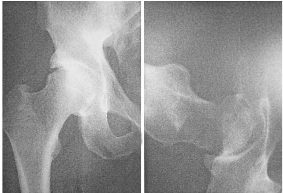
Fig. 1 X-ray of the right hip judged as normal

Right hip joint X-ray was normal (Fig. 1), but a new MRI (Fig. 2) revealed a high density mass at the level of the right acetabular roof and the gluteus minimus muscle. A computed tomography (CT)-guided puncture was done and a purulent liquid was drained from the collection site. The CT scan control showed a net diminution of the collection volume. Two days later, the patient was pain free, independent and was discharged home. Antibiotic treatment combining oral rifampicin and doxycycline was instaurated. This treatment was chosen because the preliminary results of the drained liquid revealed the presence of a gram-negative infection.