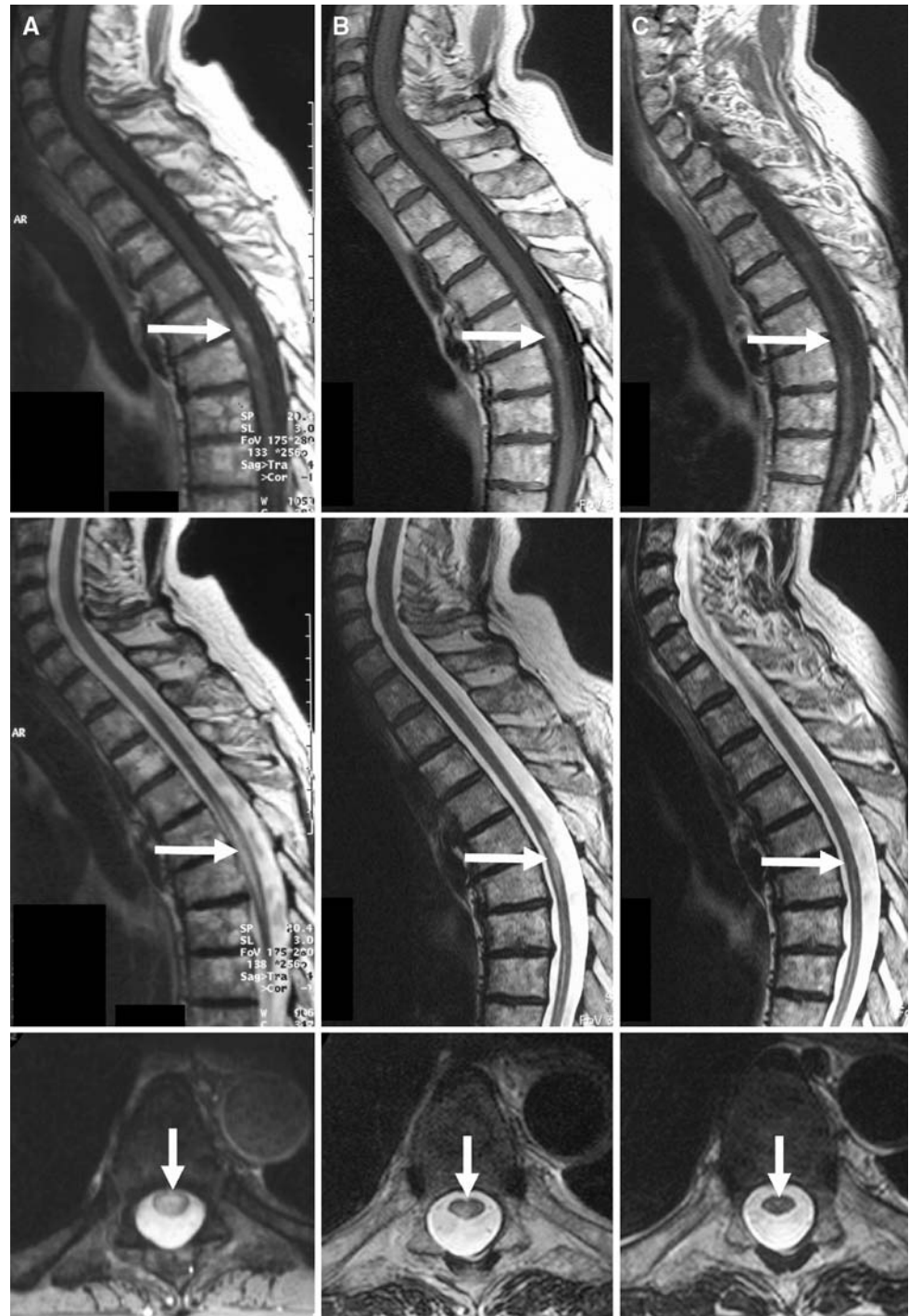
Fig. 3 Fifty three year old man (patient 7) with multiple myeloma after spinal irradiation of Th 5–7 with 32 Gy. Sagittal, contrast-enhanced T1w (upper row), sagittal T2w (middle row), and axial T2w images (lower row) are shown. The first MRI showed a pronounced edema of the myelon at the level Th 5–9 and a significant contrast uptake (A, white arrows). Three months later, MRI showed regression with residual edema and reduced contrast uptake of the myelon at the level Th 5–6 (B, white arrows); 10 days of i.v. heparin therapy and 6 weeks of fraxiparine therapy as well as 40 administrations of hyperbaric oxygen had preceded the MRI. Follow-up 7 months after initial examination showed further improvement with only minimal residual findings (C, white arrows). Another 40 applications of hyperbaric oxygen had been administered

More importantly, there is an increasing awareness of pseudoprogression of tumors within the CNS as an early misleading MRI feature after focal radiotherapy. This may lead to the erroneous assumption of treatment failure and trigger false therapeutic decisions [11, 12]. In summary, the present case series demonstrates that anticoagulation therapy is safe but has probably only modest activity in patients with delayed radiation-induced neurotoxicity. Prospective studies using stringent diagnostic criteria for therapy-induced