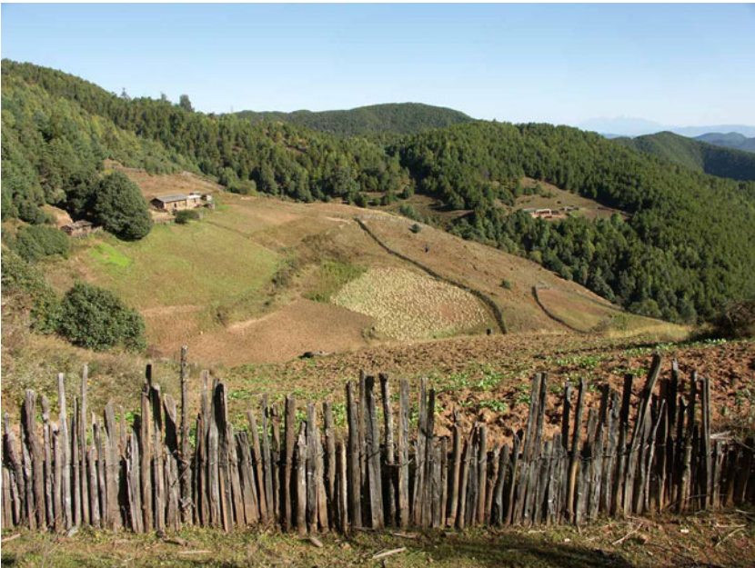
Fig. 3. Scattered houses on the hills. Potatoes, rapeseed, corn, and beans are cultivated in the fields.

with the help of an interpreter. Walks in the area with key informants were conducted to trigger their recognition of useful plants. All information received was cross-checked with at least two additional interviewees.