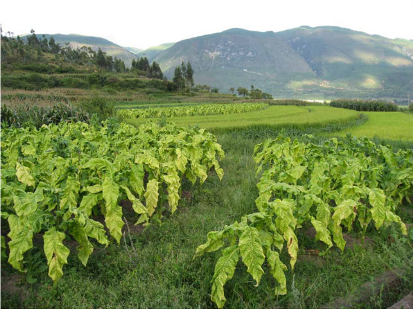
Fig. 2. Intensive agriculture in the valley bottom with tobacco in the foreground and rice paddy fields. Corn is grown in the rain-fed fields.

interviews based on listings provided by village group leaders. For farmers, the first of each village was generally chosen randomly and was then asked to name other contacts within the same village. All interviews were conducted in Chinese