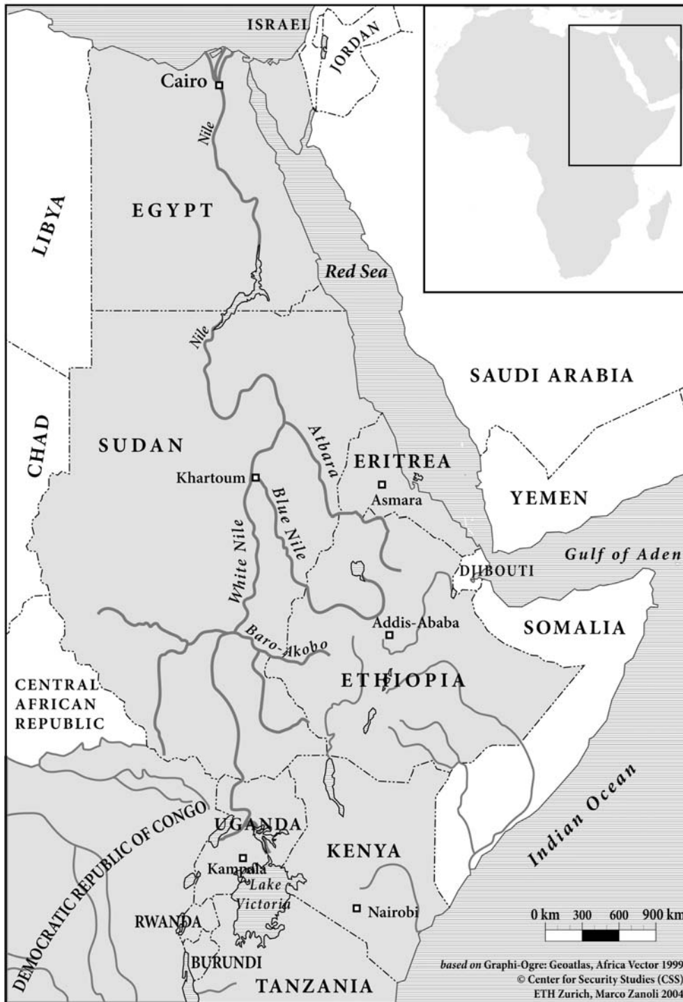
Figure 1. Countries of the Nile Basin. The Nile Basin includes two main sub-basins: the Eastern Nile Sub-basin (Egypt, Ethiopia, Eritrea and Sudan) and the Equatorial Lakes Sub-basin (Burundi, Dem. Rep. of Congo, Egypt, Kenya, Rwanda, Sudan, Tanzania and Uganda). The White and Blue Nile join in Sudan and then flow on to Egypt. The country borders do not represent officially recognized country borders. Approximate and schematic lines have been included only to clarify the geographical position of the countries in relation to the main Nile tributaries.