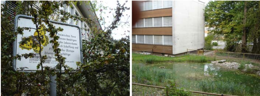
Fig. 2 The schools were sensitive to environmental issues. Left: A hedge of local plants in front of a school, marked by an explaining table. Right: A pond manufactured by science teachers and their students in a school project

cooperation schools. Many schools had implemented reasonable light and climate management and an outdoor area like a hedge (Fig. 2, left) or a pond (Fig. 2, right), where students could enjoy and study nature, fauna and flora.