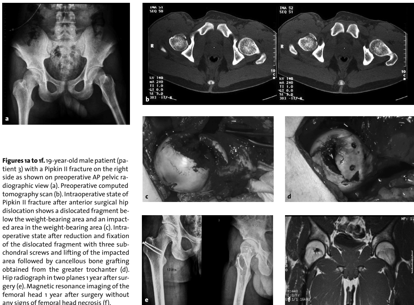
Figures 1a to 1f. 19-year-old male patient (patient 3) with a Pipkin II fracture on the right side as shown on preoperative AP pelvic radiographic view (a). Preoperative computed tomography scan (b). Intraoperative state of Pipkin II fracture after anterior surgical hip dislocation shows a dislocated fragment below the weight-bearing area and an impacted area in the weight-bearing area (c). Intraoperative state after reduction and fixation of the dislocated fragment with three subchondral screws and lifting of the impacted area followed by cancellous bone grafting obtained from the greater trochanter (d). Hip radiograph in two planes 1 year after surgery (e). Magnetic resonance imaging of the femoral head 1 year after surgery without any signs of femoral head necrosis (f).

femoral or triradiate approach are used [2, 4–7, 9, 11]. However, these extensile approaches result in significantly increased patient morbidity.