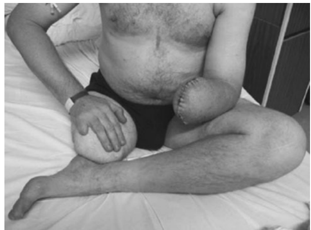
Fig. 2 Even if atypical, this case of a man in his early 50s illustrates that theories of BIID unilaterally focusing on a failed integration of a particular limb cannot account for all clinical shades of the disorder. After having forced an amputation of the right leg, satisfying the initial desire for amputation, a new desire arose, this time targeting the right little finger. Later the desire for amputation spread to the little finger and then to the ring finger of the left hand, and ultimately to the whole forearm. After Sorene et al. (2006), Fig. 2 reprinted with permission