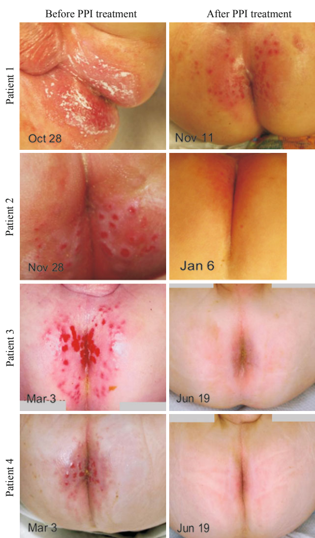
Fig. 2. Photographs of perianal skin conditions in patients 1-4 before and after 3-10 weeks of potato derived protease inhibitor treatment.

In patient 3, the score decreased from 7 to 2 during the first 17 days. From day 17 to day 36, the score remained at 2-3. On days 37 and 38, the boy suffered from diarrhea and the score reached 8 on day 39, then dropped again to 1-2 on days 51-54.