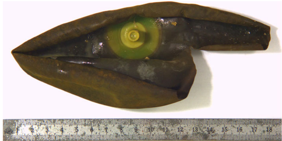
Fig. 2 Deflated intragastric balloon