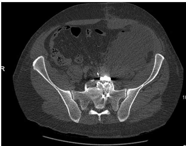
Fig. 1 Pelvic CT scan of case 1 taken 5 weeks following surgery showing recurrence of a left retroperitoneal fluid collection despite drainage

Following initial open fixation of her femoral fracture she underwent posterior decompression and L4–S1 stabilisation followed a week later by an anterior L5 corpectomy and allograft fusion through a left retroperitoneal approach. One week following surgery she developed a painful swelling of the left lower abdomen. Ultrasound showed a 16 \times 13 \times 8 cm heterogeneous collection suggesting possible haematoma formation. Computer tomography (Fig. 2) confirmed this collection, in continuity with the operative site, suggesting according to