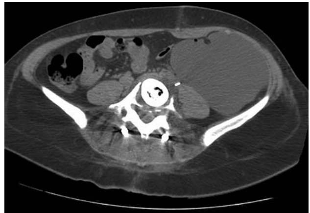
Fig. 2 CT scan of case 2 showing a large fluid collection on the left side

the reporting radiologist—familiar with this complication in urological surgery—a lymphocoele. A vacuum drain was inserted under local anaesthetic draining after 7 days 10 cc/24 h clear yellowish fluid. Cytology and biochemical analysis of the fluid showed no pus cells and a low urea concentration. Following drain removal no recurrence of the painful swelling was noted. At 1 year post surgery an ultrasound of the abdomen showed no further fluid collection while the patient remained asymptomatic.