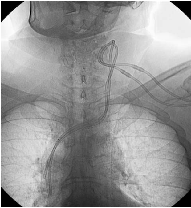
Fig. 4 Two guidewires were placed by a left jugular approach through the stent in the superior vena cava. After verification of good position of the guidewires, the catheters were placed over the wires into the peel-away sheath under fluoroscopic guidance. After the peel-away sheaths were removed and the catheter tips placed in the right position, the catheters were placed in a subcutaneous position

which was successfully managed by percutaneous endovascular stripping in two cases using a snare loop technique. In the other patients, the HC was removed because