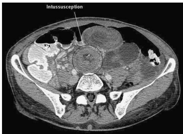
Fig. 2 CT scan showing a typical target sign, together with dilated and thickened jejunal loops, suggesting edema and ischemia