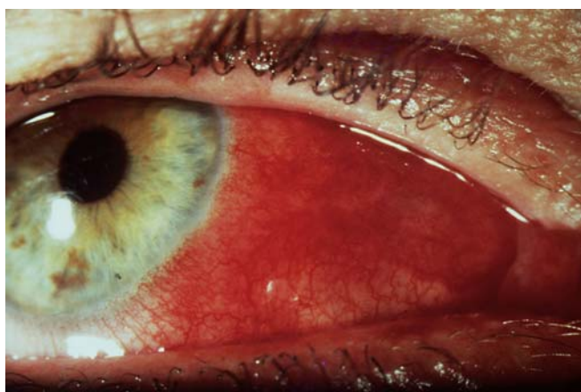
Fig. 3 Ophthalmological picture of the episcleritis of case 3 (atypical Cogan's syndrome)

A 49-year-old man complained of a sudden bilateral hearing loss within a few weeks, but without vertigo or dizziness. Nine months later, the patient suffered from repeated fever episodes, arthralgia, loss of weight and a severe bilateral nodular scleritis, resistant to a 2-month locally administered steroid therapy (Fig. 3). Because of additional progressive hearing loss, an otoneurological examination was performed. This revealed a bilateral sensorineural hearing loss in the high frequencies with normal BEAP latencies as well as