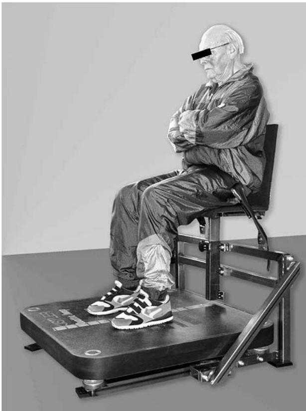
Fig. 1 Maximal isometric extension strength of the legs (MEL). Measurement of MEL (hip and knee extension) on a force platform (Quattro Jump ® , Kistler Instrumente AG, Switzerland) in a seated position at 90° for the lower limb joint angles (foot, knee and hip)