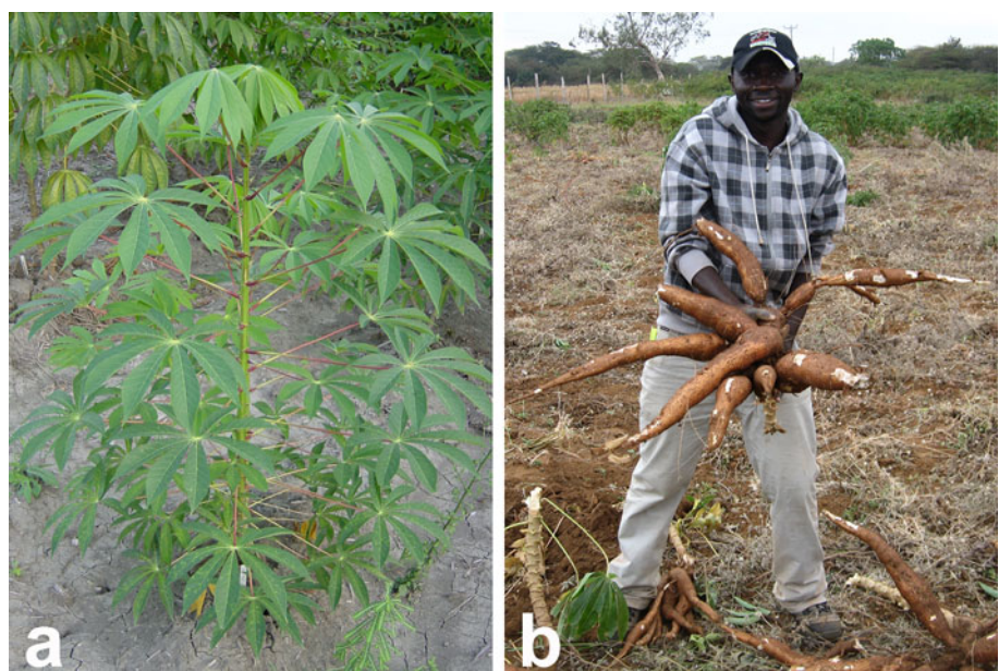
Fig. 1 Cassava ( Manihot esculenta Crantz) (a) and storage roots harvested in Kenya (b)

Cassava production is also hindered by numerous abiotic factors that include infertile soils, post-harvest root deterioration, planting of unimproved traditional varieties and inadequate farming practices. The planting of sub-optimal material, for example unimproved varieties or diseased cuttings, is exacerbated by the virtue that cassava is vegetatively propagated; without an organised and