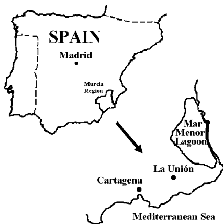
Fig. 1 Location of sampling area

N, 0°48'12" W) is at the Southeast of the Iberian Peninsula and covers an area of 50 km 2 (Fig. 1). The semiarid climate of the zone is typically Mediterranean with an annual rainfall of 250–300 mm. The annual average temperature is 18°C. Mining occurred in this area for more than 2,500 years until it ceased in 1991 for economic and environmental reasons. Base metals were smelted from sulfide minerals that included galena and sphalerite. The wastes from mining refining operations were stockpiled into tailings. These tailings pose a risk to local ecosystems and human health, due to the dispersal of dust and sediments by erosion (Conesa et al. 2006). Some are near urban and agricultural areas, increasing the risk of human exposure to metals via wind-borne dust or consumption of contaminated garden and agricultural crops.