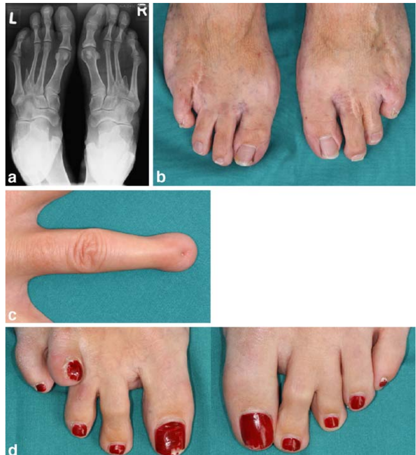
Fig. 1 Pictures of dysostosis in CDA I. a X-ray photograph of the feet of case 1. b Feet of case 1. c Hypoplasia of the distal phalanx of the fourth finger at the left with nail hypoplasia of case 1. d Right and left foot of case 2

The second patient (UPN 177/01 of the German CDA Registry) is a 48-year-old Caucasian female from Switzerland. One brother and both parents are not anemic and show no skeletal malformations. The family was traced back for two generations. Besides inborn anemia, the proband has mutual malformations of her toes (Fig. 1) and moderate bilateral ptosis like the first case. After birth and during infancy, she received multiple transfusions. At the age of 9 years, splenectomy and, 6 years later, syndactyly correction of the third and fourth toes on the right foot were performed. After splenectomy, the transfusion interval was reduced, and after adolescence there was no need for further transfusions. Because of increasing ferritin levels, a liver biopsy was carried out at the age of 38, which showed massive siderosis and beginning cirrhosis. An iron chelating therapy was started with deferiprone and was proved to be successful in a second biopsy 3 years later with almost complete normalization of the former findings.