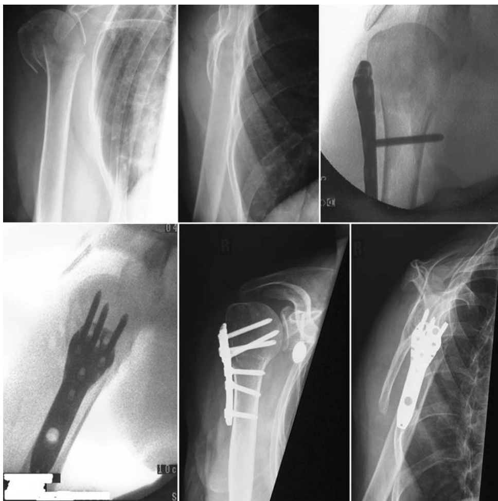
Fig. 1 Surgical technique of indirect fracture reduction using the plate as a buttress. Image intensifier images and postoperative X-rays

After approval from the ethics committee had been granted, the first 50 patients to be treated with the NCB ® PH for an acute traumatic fracture were prospectively enrolled in the study starting in May 2004. Endpoints of the study were the clinical and radiological outcomes and complications after 6 months. Clinical parameters included range of motion (ROM) in flexion and abduction, and the subjective success of the outcome was based on a high, intermediate or poor level of patient satisfaction. Radiological parameters included union/non-union, implant loosening, screw perforation and avascular necrosis (AVN). Exclusion criteria were pathological fractures (caused by neoplasia), hardware failure of other implants whereby the NCB ® PH was a revision procedure, preoperative axillary nerve damage and inadequate follow-up. Adequate follow-up was considered