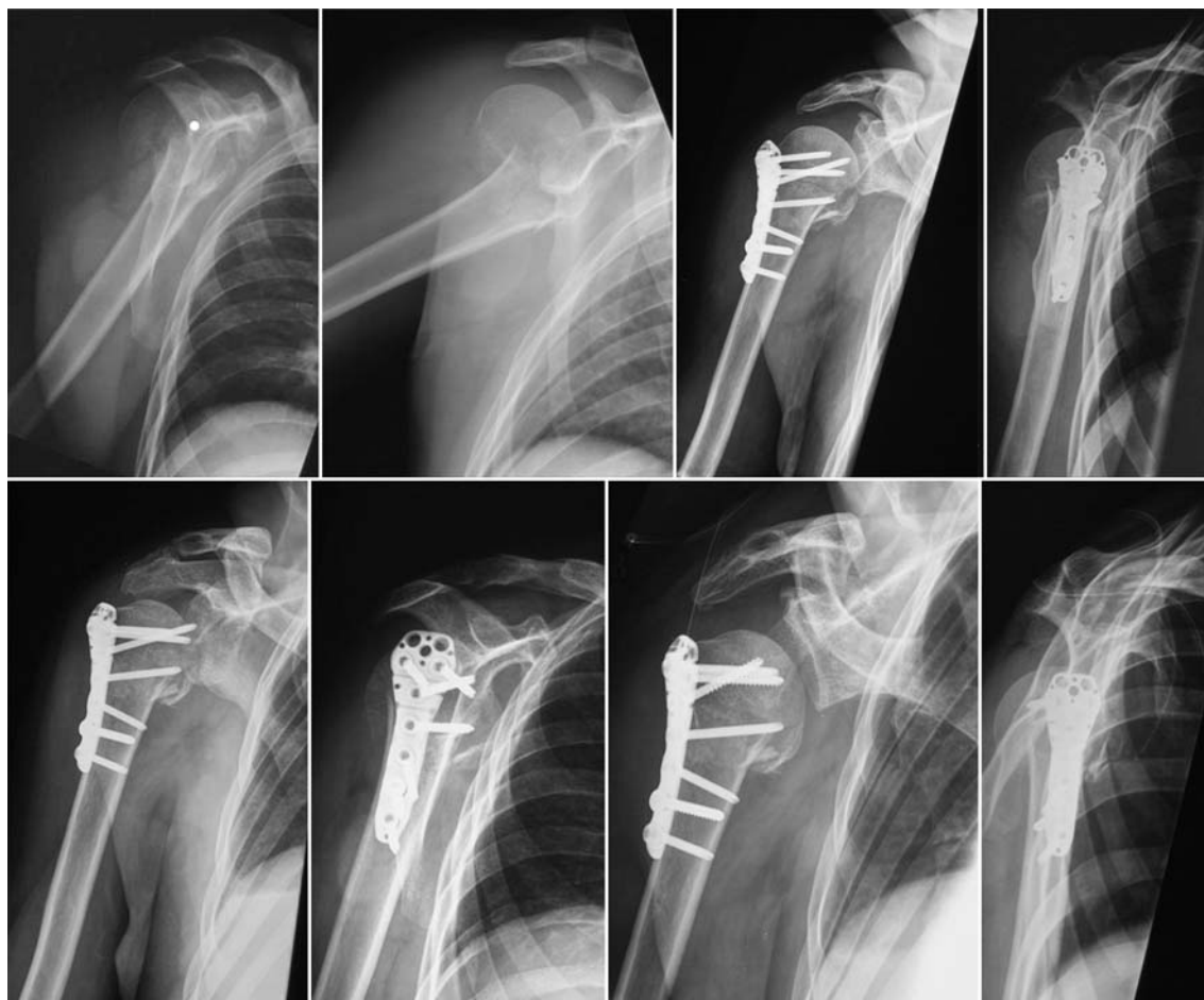
Fig. 4 These radiographs show the radiological course of an AO ASIF 11 C2 fracture in a 47-year-old male. At the 6-week follow-up, cutout of one screw was visible in the glenohumeral joint and

conversion to a shorter screw was performed. Ten months after the injury the Constant score was 60