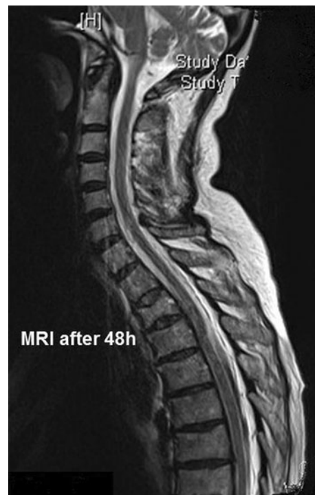
Fig. 2 MRI after 48 h revealed no epidural hematoma and no compression of the spinal cord

SSEH is a rare disease, unrelated to trauma such as lumbar puncture. It occurs most frequently after the fourth or fifth decade [5] but it has been reported in all age groups. It accounts for 0.3–0.9% of epidural space occupying lesions [3], while anticoagulant therapy accounts for up to 17% of cases [5]. The male:female ratio of occurrence is 1.4:1 [6]. The most common location of SSEH is the cervicothoracic and thoracolumbal junction. The majority are located posteriorly or posteriolaterally, where extensive networks of venous convolute, namely the posterior internal vertebral venous plexus (IVVP) are found [7]. The anterior haematoma in our case is rare in SSEH. Several risk factors including anticoagulant, platelet-aggregation-inhibitor therapy, coronary thrombolysis, factor XI deficiency,