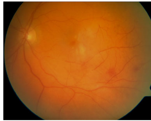
Fig. 2 Retinal image of a 66-year-old female patient (see Table 1) who had undergone uncomplicated vitrectomy with retrobulbar anesthesia for a macular hole using 15% SF 6 -gas filling. Occlusion of the retinal artery occurred 2 days after surgery

assessed by carotid Doppler sonography, echocardiography, transesophageal echography, and 24-h electrocardiography, no critical systemic risk factors for vasooclusive events were identifiable in any of the subjects. Nevertheless, three of the patients had a history of treated arterial hypertension; one of these suffered from diabetes mellitus, and one had undergone prophylactic treatment with aspirin for cardiac problems after surgery for an aortic aneurysm 23 years earlier (Table 1). Beyond confirmation of an optimal therapy of their preexisting underlying diseases, all patients received (after exclusion of contraindications) a local IOP lowering therapy with timolol 0.5% for 10 days, aspirin 100 mg/day for 3 months, and a retard preparation of nifedipine 20 mg/day for 1 month. One year after surgery, visual acuity was poor in five of the patients (20/200 in four individuals; light perception in one) and excellent in one (20/20).