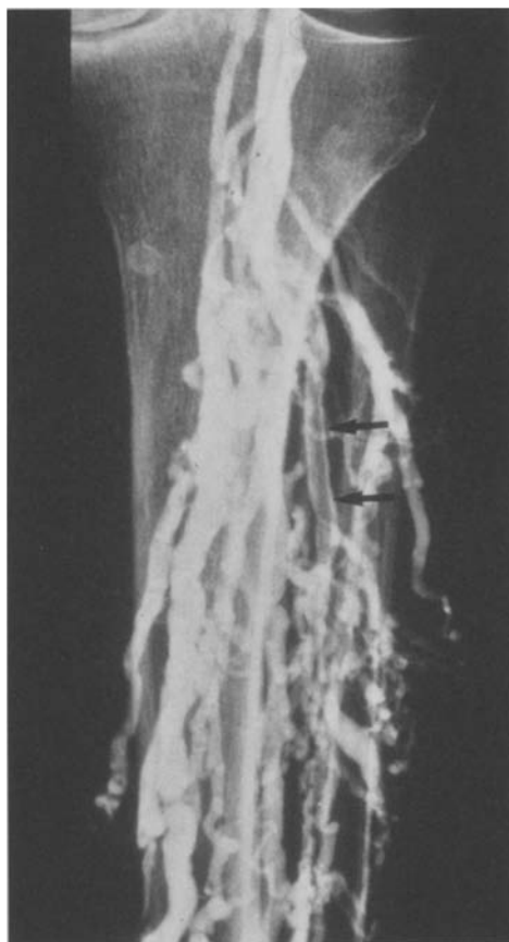
Fig. 2 Corresponding phlebography of the same patient with a fresh thrombosis in the fibular veins