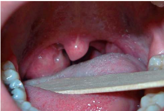
Figure 1. Acute exudative tonsillitis with a whitish-yellow exudate.