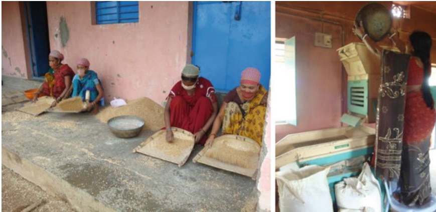
Fig. 10.6 'Nutrimix' making by members of MDMMS

There is irregular electricity supply in this area, and the quantity and quality of the product suffer due to it. The two-stage biomass gasifier will provide regular and clean supply of electricity at a low cost, which will increase the production and their income by over 500%. The increase in production will support more women and children at the Anganwadi centres, and the increase in the income generated will improve standard of living of the workers and give them an opportunity to explore more activities and build training centres.