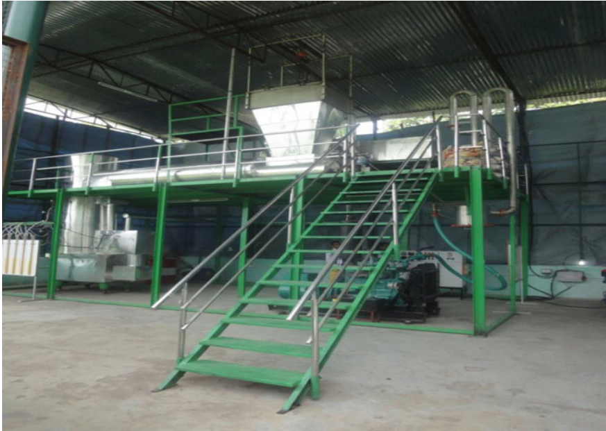
Fig. 10.7 Two-stage biomass gasifier in Rayagada, Odisha