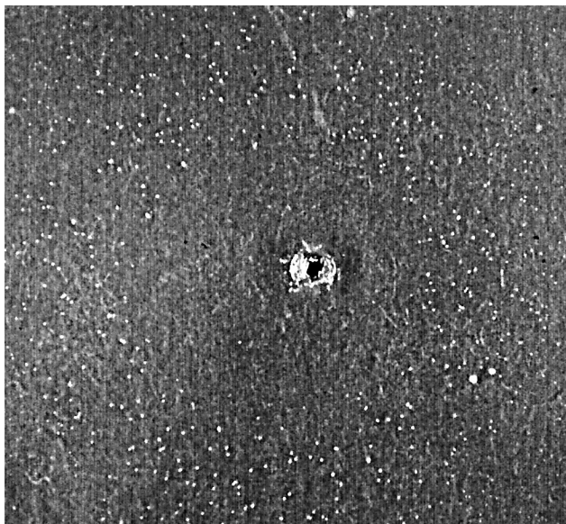
FIG. 1. Cremophor EL assimilation test of an atypical M. furfur isolate. Note that an inhibition area around the well is surrounded by a ring of tiny colonies at 10 days of incubation.

the yeast was mixed with bacteria, and only in 9 dogs (25%) was the yeast obtained in pure cultures. Lipid-dependent species were obtained in mixed cultures with bacteria from three dogs (5.3%). In one of them, the species M. pachydermatis was also isolated.