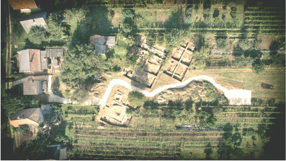
Illustration 2. Aerial photograph of the excavation Detail of the mosque, the türbe and the dervish convent.

hall of the türbe . Decorative elements found amid the ruins of the building are akin to those on Sultan Süleyman's türbe in Istanbul. These 2015 excavations and the other testing and analyses all suggested that this building was Süleyman's türbe . Further investigation was nevertheless required in order for us to be able to state this with 100-percent certainty. Specifically, the ruins of nearby buildings needed to be excavated. This is why in the spring of 2016 we began to unearth the remnants of the presumed mosque and dervish convent.