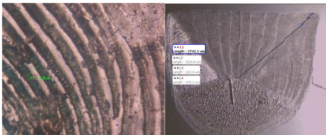
Figure 2: Measuring the distance of scale center to the annual growth rings (left) and the distance of growth rings in each annual areas (right).