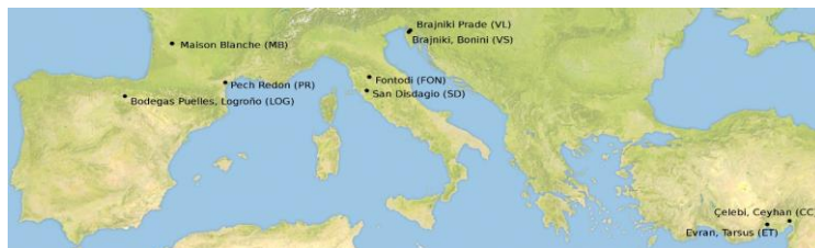
Figure 2. Localization of experimental farms in RESOLVE project.

The wine grape cultivars were Sangiovese (SD and FON), Tempranillo (LOG), Cabernet Franc and Syrah (MB and PR, respectively), Refošk (VS and VL) and table grapes, namely Early Cardinal (ET) and Yalova Incisi (CC). The ages of the vineyards ranged between 10 to 20 years in LOG, SD, FON, VS, ET and CC, 30 to 40 years for PR and VL and 70 years in MB. Climate was temperate oceanic in LOG, MB, VL, VS and warm Mediterranean in the others sites.