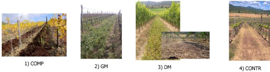
Figure 4. Pictures illustrating applied restoration strategies: COMP , composted organic amendment; GM , green manure; DM , dry mulching and the degraded control ( CONTR ).

The farms where cover crops had a good growth were: SD (Italy), CC and ET (Turkey). These farms had in common emergency or regular base irrigation and seedbed preparation by rotary tiller. In some cases, as FON (Italy), VS and VL (Slovenia), good cover of natural grass was observable instead of seeded cover crops.