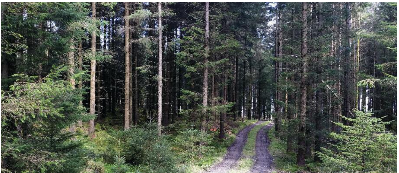
Figure 2. Sitka spruce in transformation to CCF at Bryn Arau Duon Forest, Wales. This large upland forest is at an altitude of 400m. The stand in this image was established in 1962 and has a Yield Class of 16. It has been thinned 3 times on a 4 year cycle. The focus at each intervention is to concentrate the increment on high quality trees. Natural regeneration is beginning to be established in many stands across the forest. Also note that there is a well-developed infrastructure that supports access to the stands.

A critical element of CCF is the selection and marking of trees to remove and retain at each stand intervention. A detailed understanding of tree development and quality criteria is required. Linked to this is a need for regular, simple inventories of stand structure. Information about diameter distribution, stem quality classes, growth increment and basal area is necessary to prepare tree marking prescriptions and monitor overall stand performance.