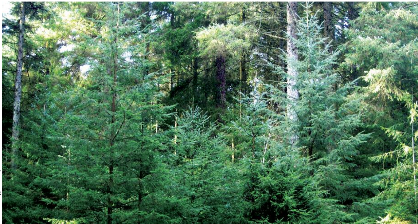
Figure 1. Continuous cover forestry in a mature stand of Sitka spruce at Whinlatter Forest, Cumbria, England. The stand was planted in 1920 and is located at 313 m altitude; it has a Yield Class of 16. This stand has good stability, high quality trees across a range of sizes and significant natural regeneration.

Identifying potential crop trees and regular thinning are the keys to successful transformation of plantations to resilient, continuous cover forests. By Edward Wilson, Ian Short, Áine Ní Dhubháin and Paddy Purser.