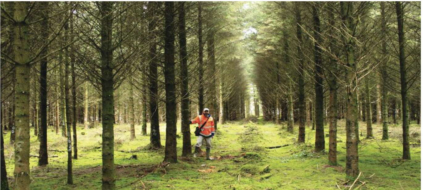
Figure 3. The TransSFor thinning experiment, Co Laois. This study is comparing stand development under “low”, “crown” and “graduated density” thinning regimes. The stand was established in 1992 and thinned in 2011 and 2014. The third thinning is scheduled for spring 2018.