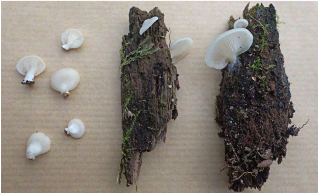
Fig. 1. Cheimonophyllum pontevedrense (holotypus, LOU-Fungi 19578).

and dried specimens. Microscopic observations were recorded with standard methods, using sections mounted in a solution of 1% Congo Red in water, 3% KOH or Melzer's reagent. Spore sizes are given in approximation to 0.5 \mu\text{m} , with extreme values given in parentheses, followed by the length-width ratio of the spores (Q). Microscopic structures were drawn with help of a drawing tube. The collected material has been deposited in LOU-Fungi herbarium (Centro de Investigación Forestal de Lourizán, Pontevedra, Spain).