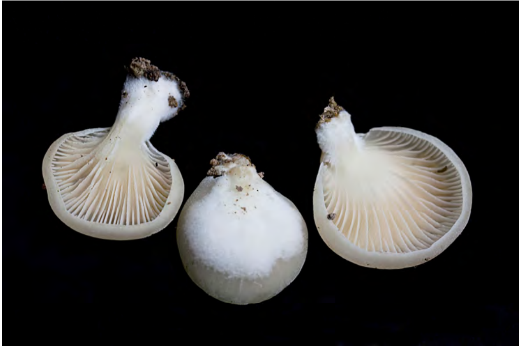
Fig. 2. Cheimonophyllum pontevedrense (holotypus, LOU-Fungi 19578).