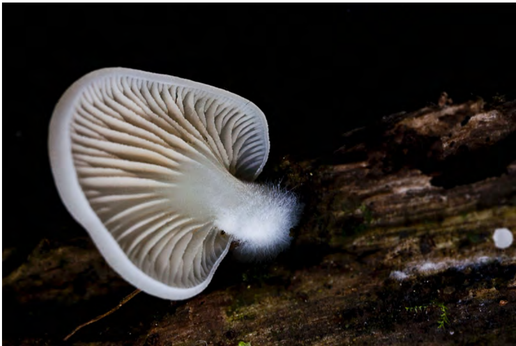
Fig. 3. Cheimonophyllum pontevedrense (holotypus, LOU-Fungi 19578).