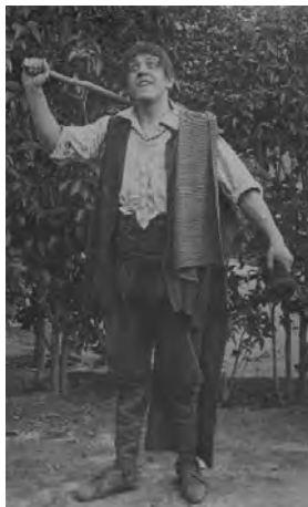
Figure 2. The actor Enric Borràs playing Manelic.

not performed in Spanish, 27 in which Guimerà explicitly portrayed an instance of adultery with all its cruelty and drama.