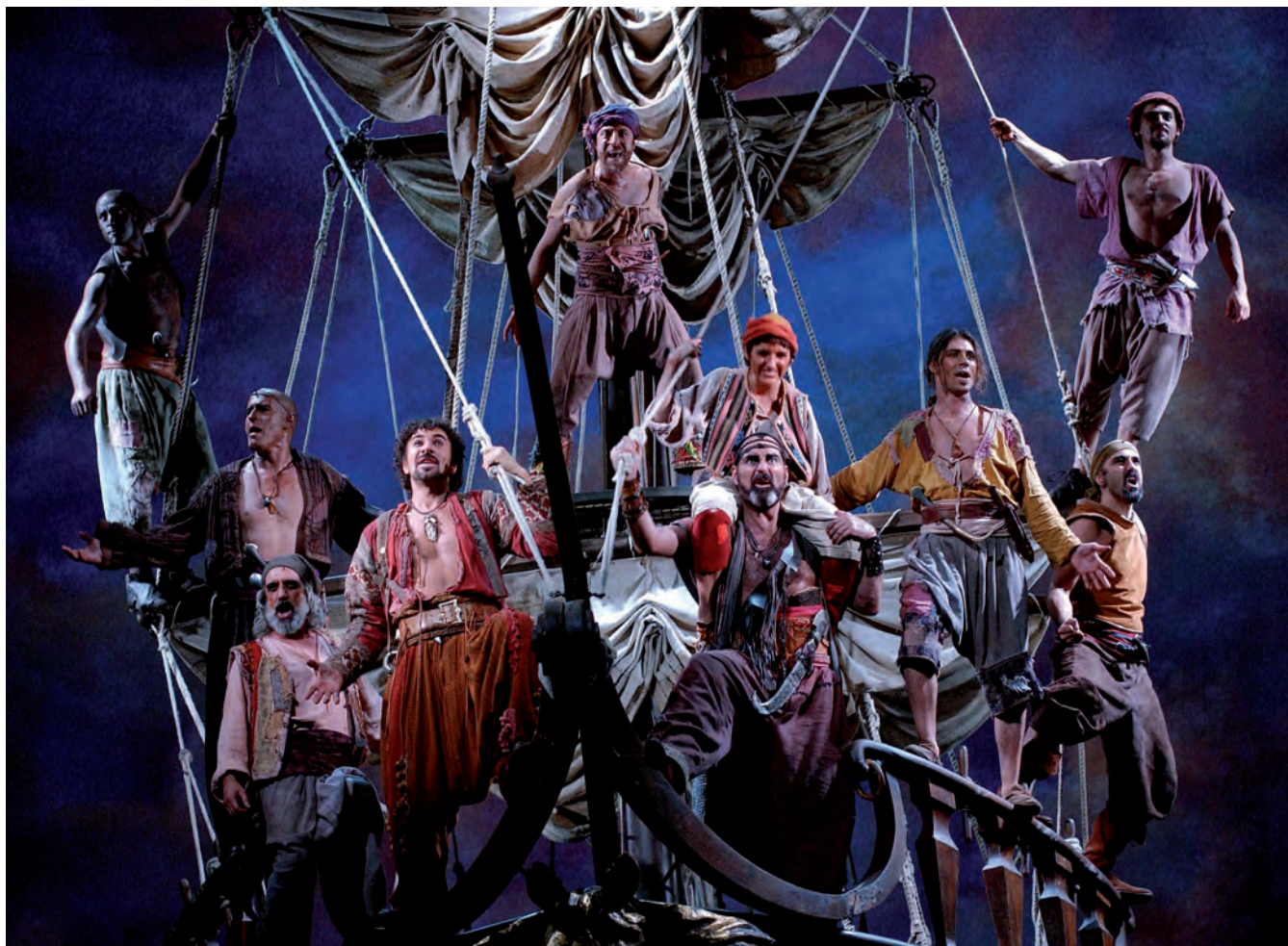
Figure 5. Scene from the play Mar i Cel in the musical version from 2008 by the troupe Dagoll Dagom. The tragedy revolves around the impossible love between a Muslim pirate and a captive Christian woman.

burgh, and Chicago, and then reports suggest that the show went on to tour other cities (“Mme. Kalich Going on Tour”). 63