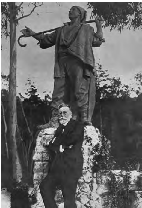
Figure 4. Àngel Guimerà next to the sculpture of Manelic on Montjuïc. Work by Josep Montserrat (1909).

Some of the foreign versions have kept the Catalan title in translation, while others have been christened with the name of the main characters, such as Manelich in the Portuguese version, Martha of the Lowlands in English, and the Sicilian attempt Feudalismo to signal that the wolf who kills Manelic, Sebastià, is the feudal lord representing this class. The German version is also titled Terra baixa or Tiefeland , following German syn-