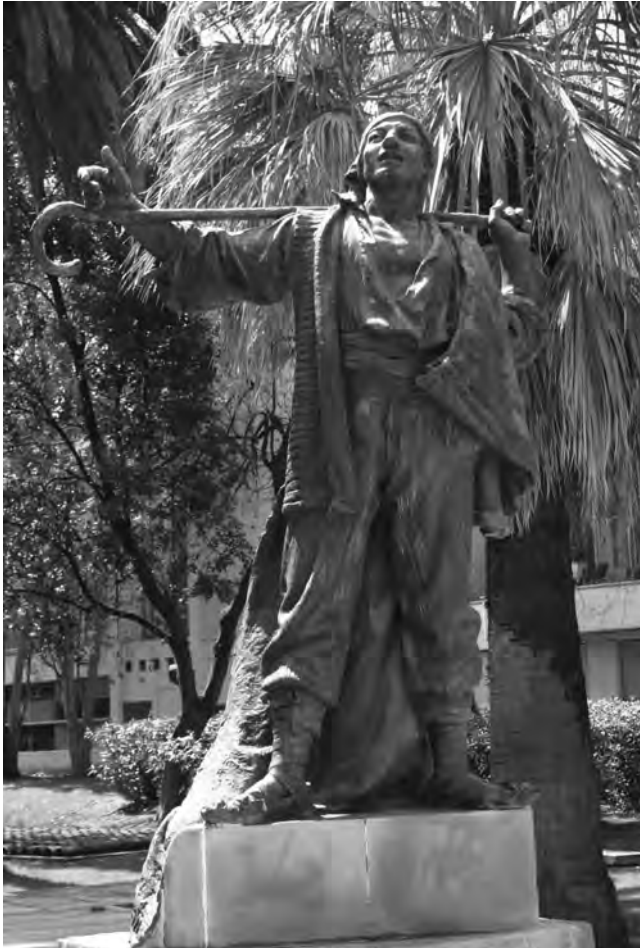
Figure 6. Manelic. Monument from 1909 to the character in Terra Baixa . The shepherd, representing the purity of the solitude of the mountains, is married to Marta, his lord Sebastià's lover, who hopes to marry her off as a way to overcome his indebtedness, yet without giving up his domineering relations with Marta. Manelic rebels, kills Sebastià and runs far away with Marta.