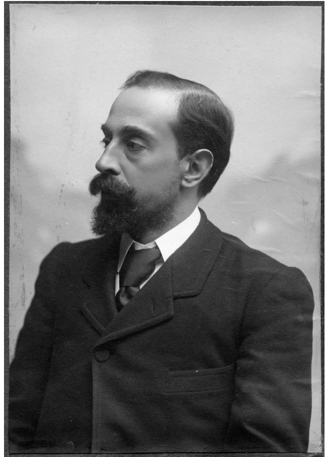
Figure 2. Portrait of Joan Maragall (Barcelona, 1860-1911). Catalan poet and writer, a crucial figure in modern poetry at the shift from the 19 th to 20 th centuries.