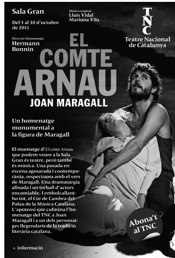
Figure 1. Poster depicting El Comte Arnau , one of the most emblematic poems by Joan Maragall, which was put on by the Teatre Nacional de Catalunya in 2011 to commemorate the 150th anniversary of the poet's death and the centennial of his death.

In Maragall's poetry, love is primarily embodied in two polarised female figures: Clara (the wife) and Haidé (the lover). The poems dedicated to Clara show a clear progres-