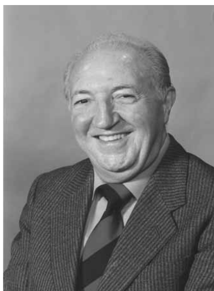
Fig. 1. Joan Oró (1923-2004).

only one carbon. By mid-1955, Oró had finished the experimental part of his doctoral thesis and thought that he would be ready to defend it in a few months. The Dean of Baylor School of Medicine recommended, however, that he waited until 1956; otherwise people might have the impression that doctorates could be obtained quickly at that school. While completing his thesis, Oró taught as an instructor in the