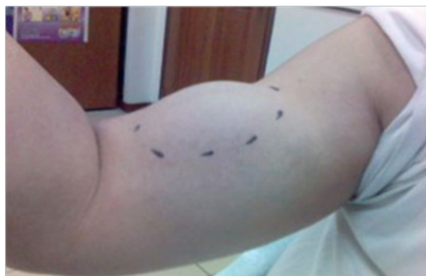
Figure 2 Intra-muscular abscess of the right bicep. 39

that 42% of those tested were counterfeit, either containing different steroids to what was declared or none at all.