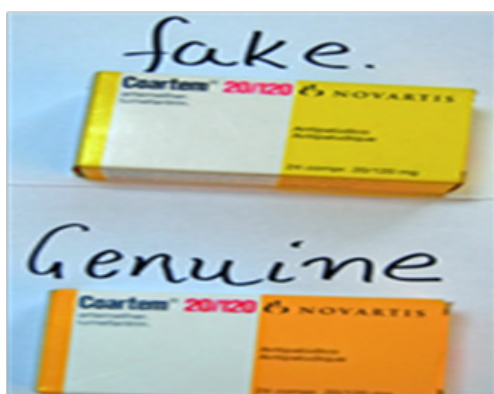
Figure 4 Counterfeit packaging recovered during Operation Zambezi in 2009. 12