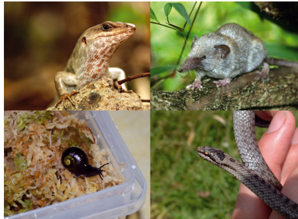
Figure 3 Conservation in action. The application of molecular detection of trophic links is already gaining specific conservation attention. Clockwise from upper left: to look at potential competition for resources between native skinks and invasive shrews on Ile aux Aigrettes, to determine mechanisms of range limitation in smooth snakes and for managed reintroductions of the endangered snail Powelliphanta augusta .

For example, Smooth snakes ( Coronella austriaca , Fig. 3) are widespread in Europe but have a limited distribution in the UK. Recent molecular analyses have suggested a possi-