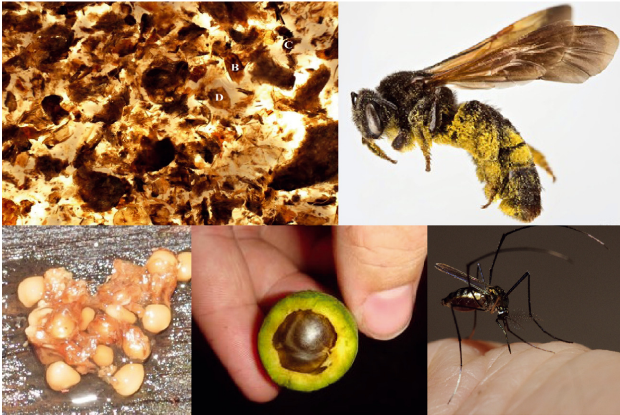
Figure 1 A wide variety of interactions occur in nature and all cases leave behind traces of environmental DNA. Clockwise starting at top left, DNA from crushed insects (B, C, D) in faeces can identify the insect prey and the predators DNA is present in traces, bees carry pollen, which provides plant DNA, parasites blood meals are a source of DNA from visited animals, chewed seeds have saliva and deposited seeds epithelial cells, which can be used to identify the dispersing animal (Photographs used with permission: mosquito – M. Brock Fenton, bee – L. Packer and Bee Tribes of the World, all others E.L. Clare).

conservation biology. This approach will be particularly effective if measured over time and space allowing us to better predict functional responses to environmental change.