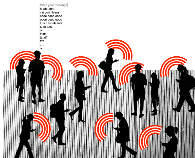
Figure 1: Concept image of the project

We are trying to build a participatory environment based on Eco's idea of open work [3]. New technologies are providing medium to several of works dealing with participation issues and smart phones usage in performances as such as Mood Conductor [4], Open Symphony [7, 6], Crowd in Cloud [1] and TweetDreams [5].