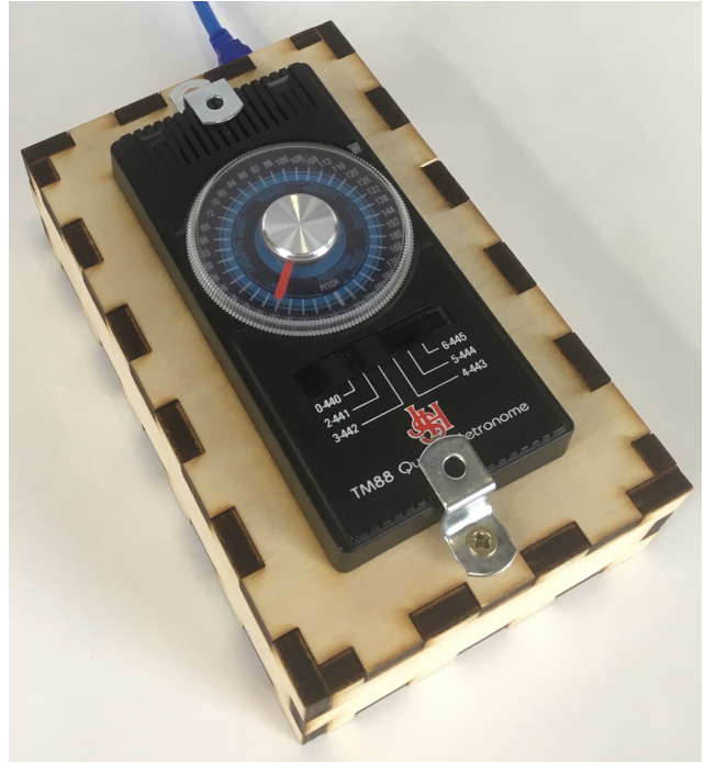
Figure 1: Metronome Music Time Capsule interface

Hansen and Goldbeck examined the principles behind playlist construction through structured analysis of their creation. They suggest a need for mechanisms that quantify the overall value of a playlist using three component factors - item value effects (e.g. track rating or likelihood of user approval), co-occurrence interaction effects (e.g. level of synergy and/or diversity) and order interaction effects (i.e. relative and absolute positions). They also assert that current