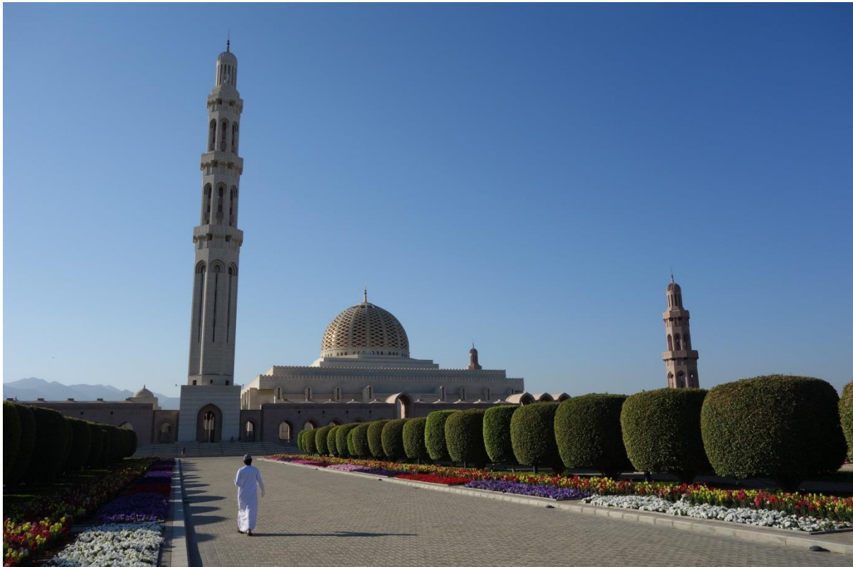
Plates 3 and 4. The Grand Mosque, Muscat, Oman