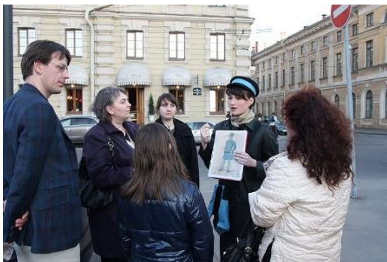
Figure 2. Museum Quarter Excursion with the Postman Guide