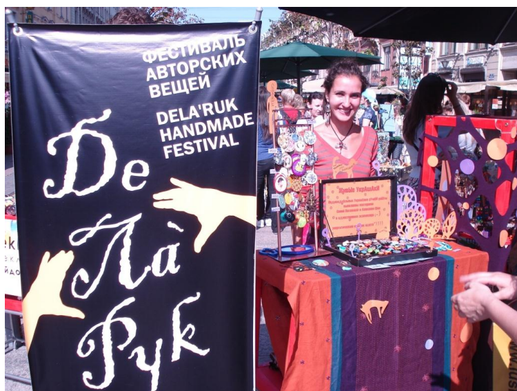
Figure 1. DeLa'Ruk Handmade Festival