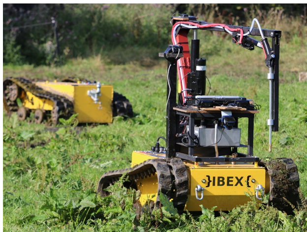
Fig. 1 Example of an autonomous small robot for agriculture (agribot). This agribot weighs 250 kg and precision spray weeds on hill farms.

In contrast, small autonomous robots for agriculture (“agribots”, Fig. 1) have focused on precision applications. Large vehicles are required for bulk operations due to the need for physically transporting bulk materials such as seeds, fertiliser and produce. Small robots make up for reduced bulk transport capability by aiming, ultimately, to work on a per-plant basis. This enables them to transport smaller amounts of more targeted materials, including reduced herbicide doses to apply to individual weeds (Binch and Fox 2017), detect the fertiliser needs of and apply fertilisers to (Singh and Shaligram 2014) individual plants; and harvesting of plants (Bac et al. 2014) when they are individually optimally ready for consumption.