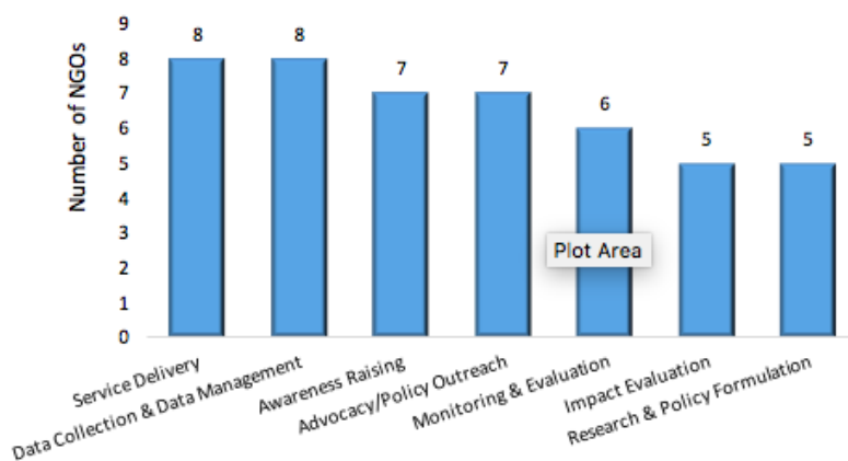
Figure 2: Type of Activities of NGOs in Pakistan