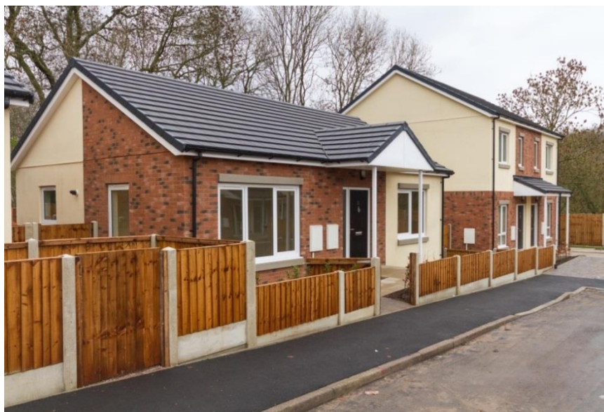
Figure 2 Completed Modular build development

Following the initial project inception, Organisation A was approached by a consortium of firms offering modular homes. The consortium consisted of three companies: a developer, a manufacturer, and an architectural firm. Company A had already worked with the architect on previous housing schemes. However, they were not familiar with the manufacturer and decided to conduct an initial assessment of the company. The management team took a visit to the factory and was impressed by the facility and the pilot house on display. The analysis of pilot house reported that timber used was of higher quality than timber used by Organisation A's projects. The visit also confirmed that the new homes would be covered by a National House Building Council approved warranty.